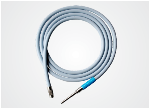
Storz's size Fibre Optic Endoscopy Cable 4.8mm, 2.3mtr Length

Endoscopy (General, Gastroenterological and Urology), Arthroscopy, Endoscopic Spine Surgery & ENT Surgery, Laparoscopy (Urology, General and Gynecological Surgery)