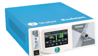
Shalya Endojet CO 2 Insufflator