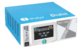
Shalya Oculus Endoscopic Camera